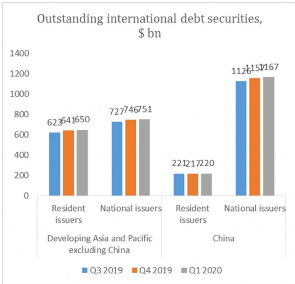
Figure 3: International debt securities issued in the region have continued to grow

It is evident that the external debt problems of developing Asia are both more complex and more subterranean than is immediately evident. How that will play out during this pandemic and global depression is therefore still open to question.